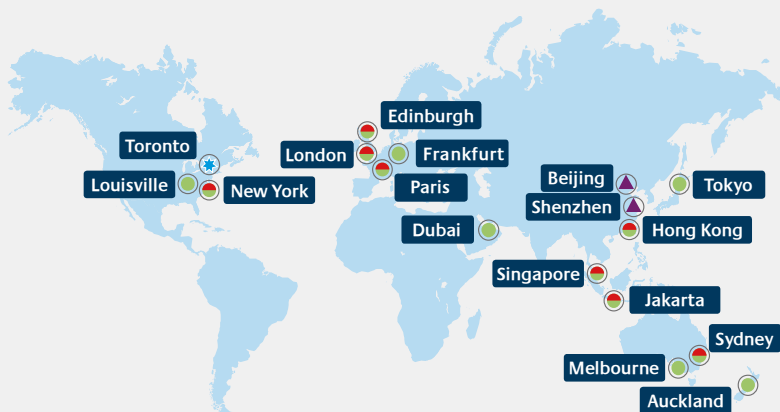
● Investment team ● Distribution team ▲ Joint venture ★ Strategic alliance - HIM Money, Inc.

Our approach to investment is driven by a commitment to providing the best possible outcomes over the long term for our investors. To achieve this, we ensure our interests are aligned with our investors and uphold a culture of always acting in our clients' best interests.